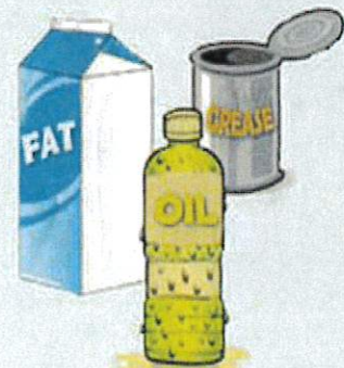
FATS, OILS & GREASE