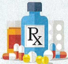
MEDICATIONS & SUPPLEMENTS