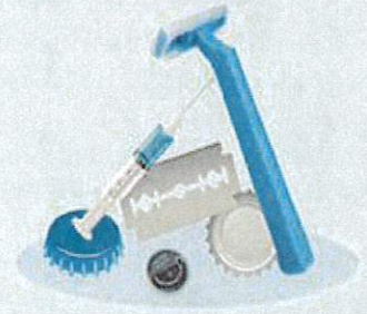
METALS & PLASTICS