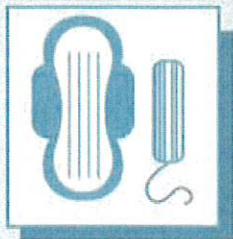
FEMININE HYGIENE PRODUCTS